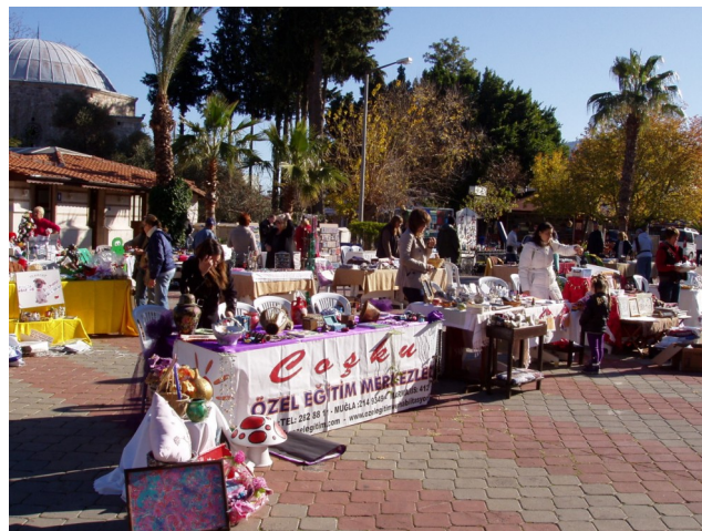
X-mas and New Year's Charity to support Coşku Special School

On December 10th Dalyan's first X-mas and New Year's fair was organised by Dalyan Dernek, the oldest of the local charity organisations. DD wanted to do a charity to support Coşku Special Education and Rehabilitation School in Ortaca, a school for students with physical and/or mental disabilities. The school has plans for a workshop to teach their students skills that will help them create their own income, e.g. by making marbled writing paper, lampshades and umbrella stands. A wonderful goal, certainly worth supporting!