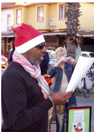
Would you believe Christmas trees and Carol singing in Dalyan?

All the charity associations in Dalyan had been invited to participate and our foundation gladly accepted the offer to have a stand at the Fair.