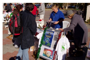
The foundation's stand at the Fair

work together. We ourselves were particularly pleased to welcome some new Friends and volunteers to support our foundation. The day showed that the Dalyan associations can work together. We ourselves were particularly pleased to welcome some new Friends and volunteers to support our foundation. Dalyan Dernek's initiative certainly deserves a follow-up!